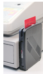
DialTran with Integrated MSR